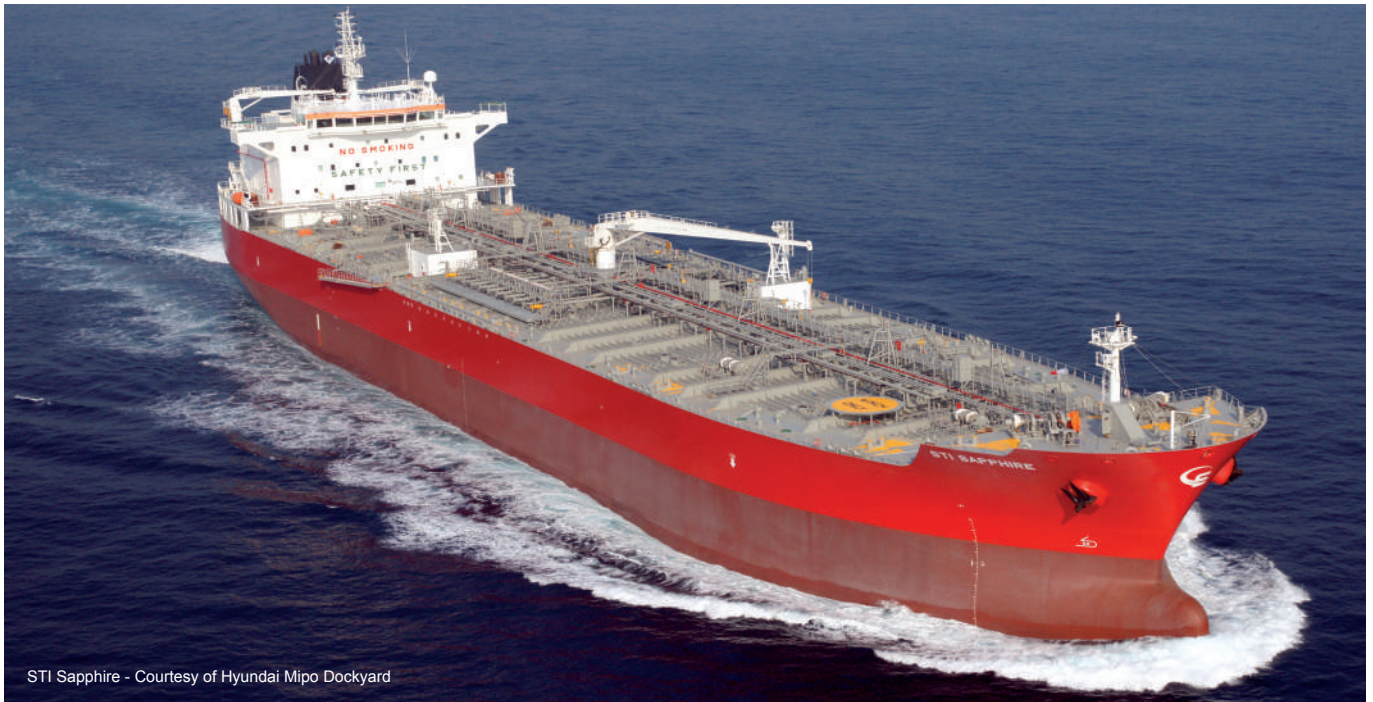
STI Sapphire

SOx scrubbers. I expect that, as usual, future fuel prices will be the deciding factor.