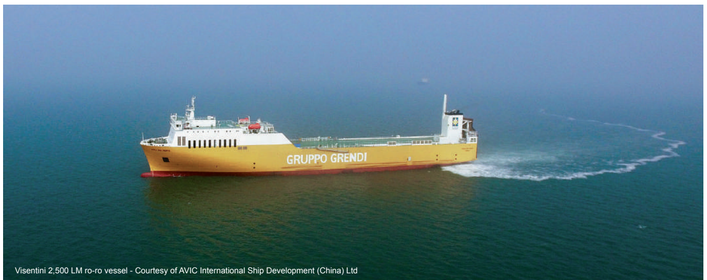
Visentini 2,500 LM ro-ro vessel

In order to be successful in the ro-ro market, we have