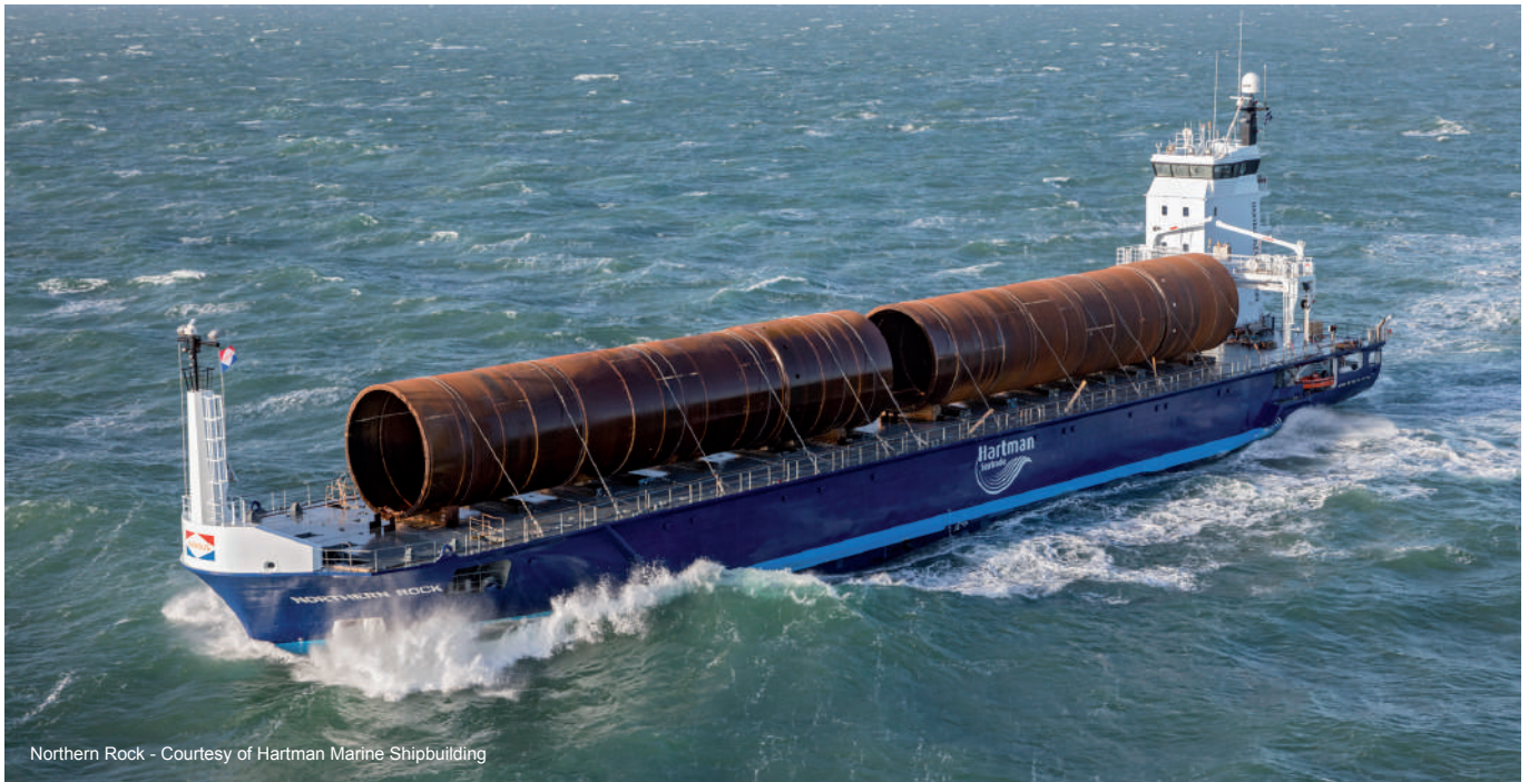
Northern Rock

carrier that can take heavy loads of up to 80 tonnes per axle, in combination with low fuel consumption and generous square meterage. These combinations of desirable features are the winning factor - not one aspect alone.