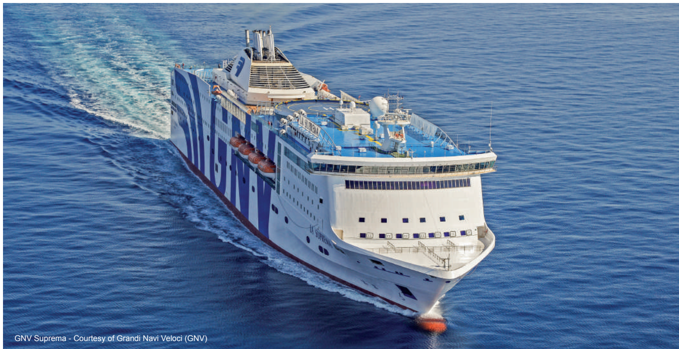
GNV Suprema

Even without LNG, however, ferries already provide tangible environmental benefits. Intermodal passenger transport based on ro-pax connections can reduce emissions compared to full road transportation by between 50% and 90%, depending on the load factor. Moreover, shipping trucks by ferry not only leads to a lower environmental impact, it also reduces road congestion.