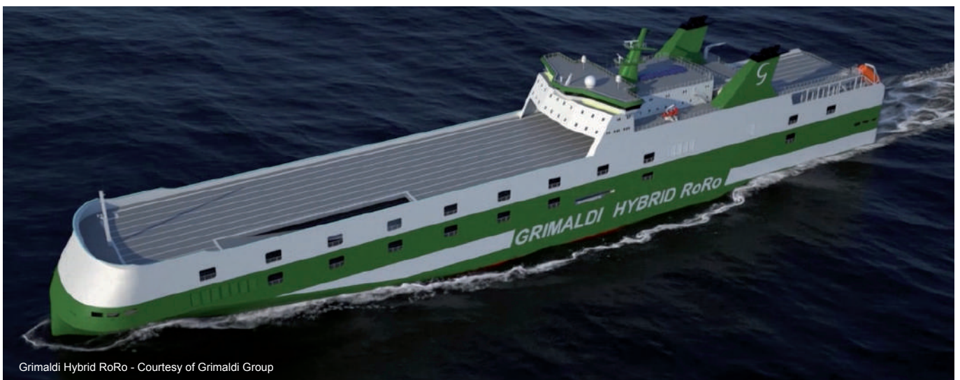
Grimaldi Hybrid RoRo

The new vessels will also be equipped with mega lithium batteries that are, until now, the world's most powerful batteries ever to be installed on a ship. Charged during navigation via shaft alternators and taking advantage of solar panels and a number of energy-saving devices while at sea, they will be able to offer eight hours of zero-emissions power while the ships are in port. The batteries will also provide benefits during navigation through "peak shaving", i.e. maintaining a constant, efficient engine speed and