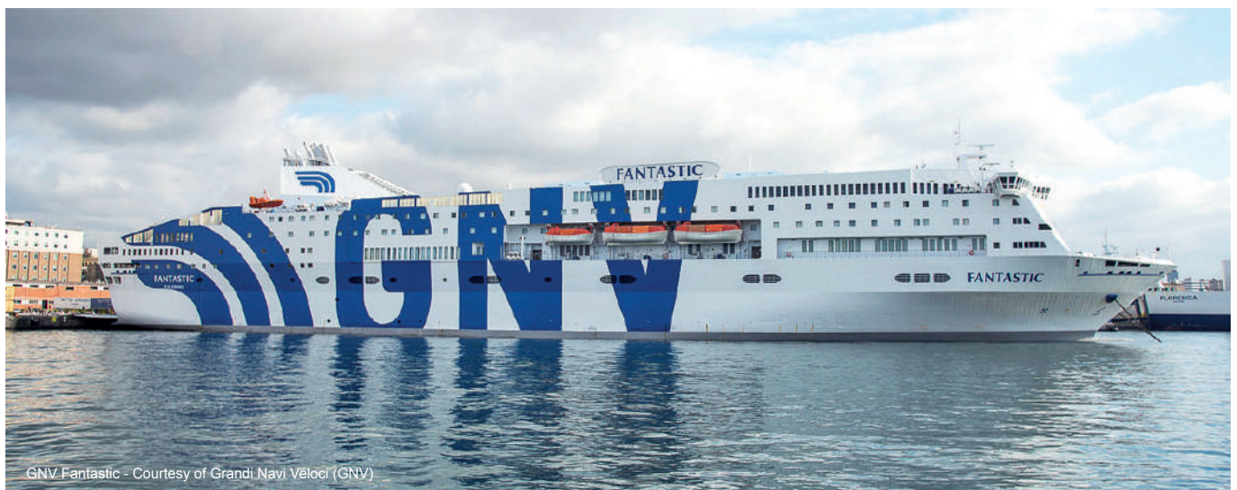
GNV Fantastic

GNV strongly supports the agreement recently signed by Italian shipowners’ associations (AssArmatori e Confitarma) and representatives of the gas sector (Assogasliquidi/Federchimica and Assocostieri) to address the infrastructure and regulatory issues around the use of LNG in port areas. By working together, we will hopefully be able to overcome the obstacles currently preventing the adoption of LNG as a fuel for ferries.