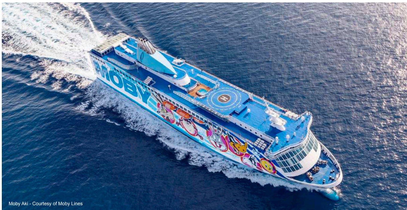
Moby Aki

One reason LNG infrastructure is slow to develop in Italy is the lack of clarity in current regulations around refuelling. We all recognise the need to reduce emissions drastically, and other countries are moving forward quickly in this area. But in Italy, we are still behind. So we build ships that can run on LNG but we continue running them on diesel. That makes no sense.