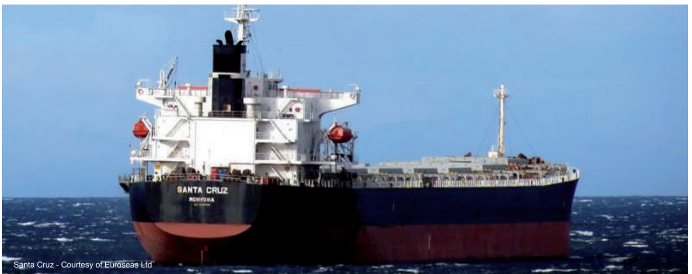
Santa Cruz

Among the many new environmental laws that affect the shipping industry is the EU MRV (Monitoring, Reporting, Verification) regulation. This requires us to report CO2 emissions for vessels larger than 5,000 GT calling at any EU and EFTA ports. We recently chose RINA to be the verifier for the EU MRV regulation for