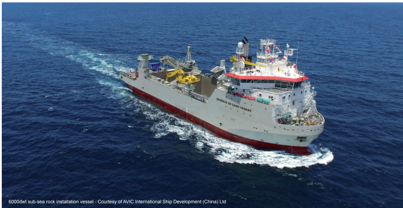
6000dwt sub-sea rock installation vessel

planned strong investment in digital technologies such as an upgraded shipyard management system and 3D software to optimise ship design. We plan to introduce more robots to automate assembly lines, improve production efficiency and perform more thorough quality controls. In addition to introducing more automation, we also have plans to upgrade the skills of our workforce through targeted, specialised training in particular areas. Finally, we are also developing more integrated supply chains.