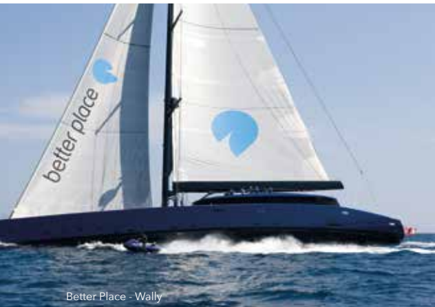
Better Place - Wally