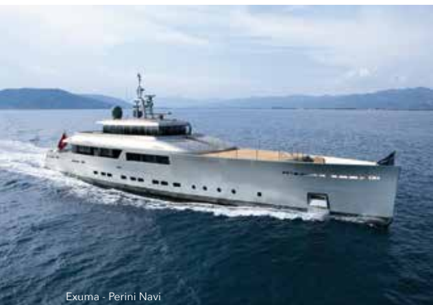
Exuma - Perini Navi