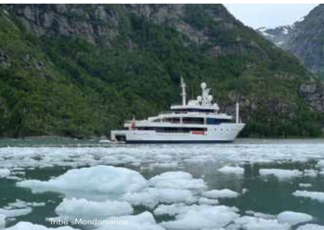
Tribù - Mondomarine