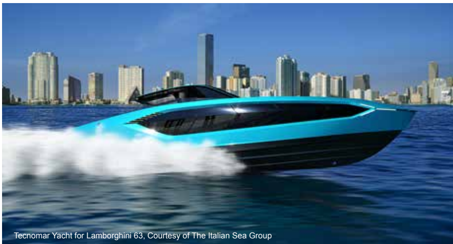
Tecnomar Yacht for Lamborghini 63