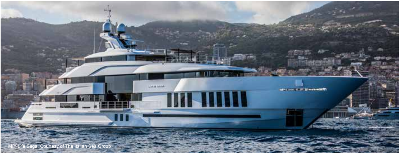
M/Y Life Saga.